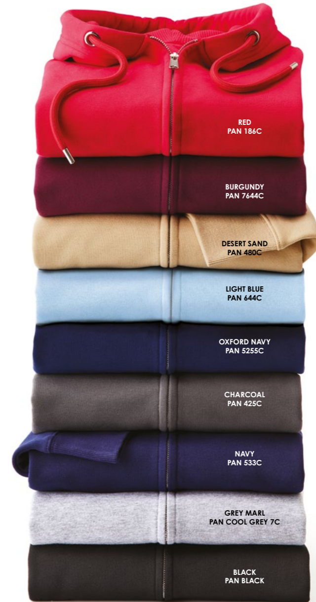
AM002 Men's Anthem Full Zip Hoodie

The best things come in threes: ethically sourced, in exceptional fabrics and ready to embellish. Like the Men's Anthem Full Zip Hoodie in soft-feel organic cotton with recycled polyester. Available in a cool collection of colours with exceptional details, high-quality finishes and a concealed zip.