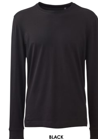
BLACK PAN BLACK