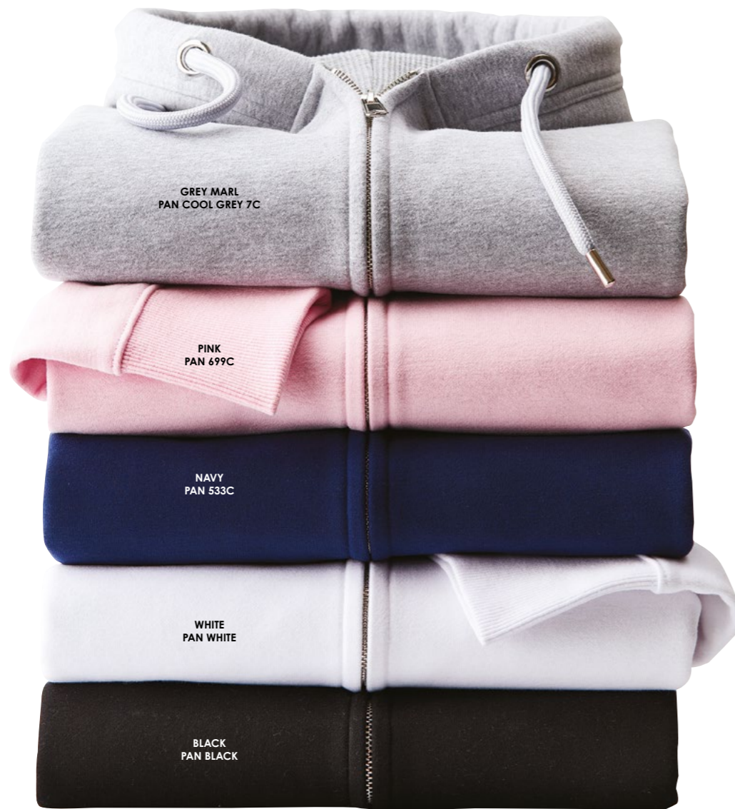
AM004 Women's Anthem Full Zip Hoodie

What's on your wish list? Eco fashion? Luxurious fabrics? Perfect for print? The Women's Anthem Full Zip Hoodie ticks all the right boxes in soft-feel organic cotton with recycled polyester. A masterpiece in muted pastels or strong neutrals with high-quality finishes and superb detailing.