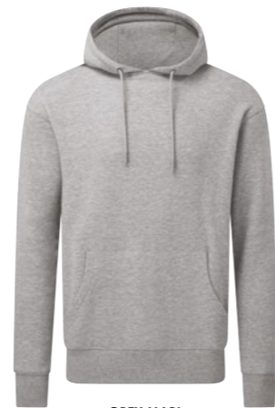
GREY MARL PAN COOL GREY 7C