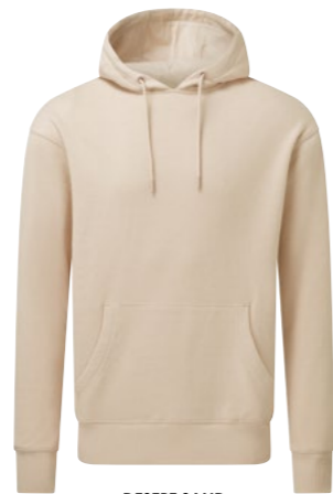
DESERT SAND PAN 480C