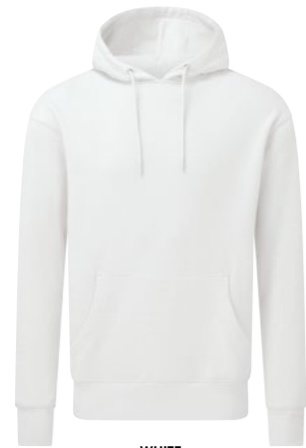
WHITE PAN WHITE

Lighten up with the Anthem Unisex Hoodie. Re-designed for 2023, it features a lightweight hood and skinny drawcords with matching eyelets and ends. Plain perfection, or ready for decoration. Because details matter.