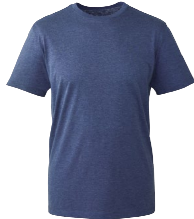
NAVY MARL PAN 4139C

Four must-have shades in Marl, an iconic twist on 60% organic cotton and 40% recycled polyester with a super-drape finish in 145gsm. Special attention has been paid to the chain stitch detailing on shoulders and nape and the twin-needle stitching to the hem and cuffs. Perfectly finished with a self-coloured size label.