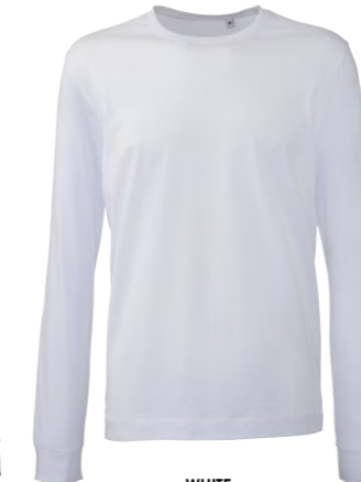
WHITE PAN WHITE