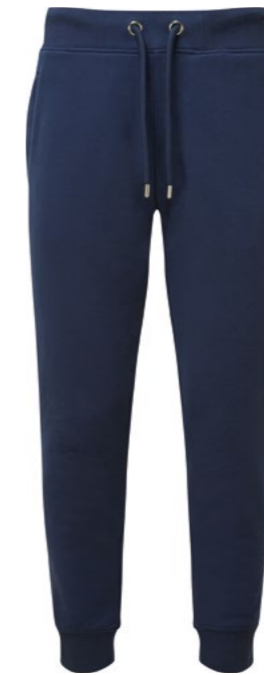
NAVY PAN 533C