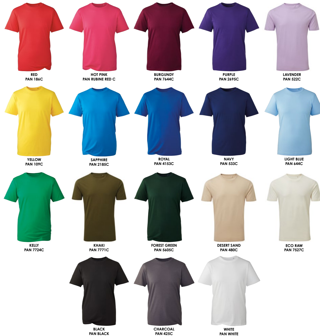
AM010 Anthem T-shirt

An iconic t-shirt with a ribbed crew neck, retail fashion fit and a soft-feel finish. Choose from a cast of incredible colours in 100% organic cotton. All with chain stitch detailing on the shoulder and nape, twin-needling stitching on hems and cuffs, and a self-coloured size pip. Essential wearing.