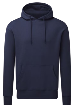
NAVY PAN 533C