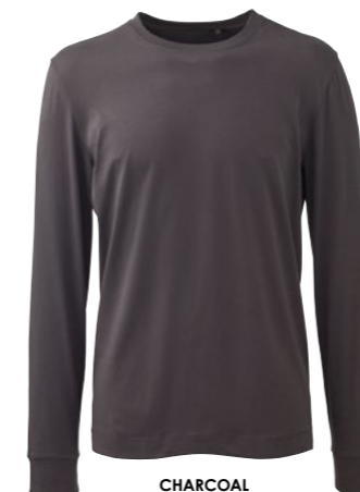
CHARCOAL PAN 425C