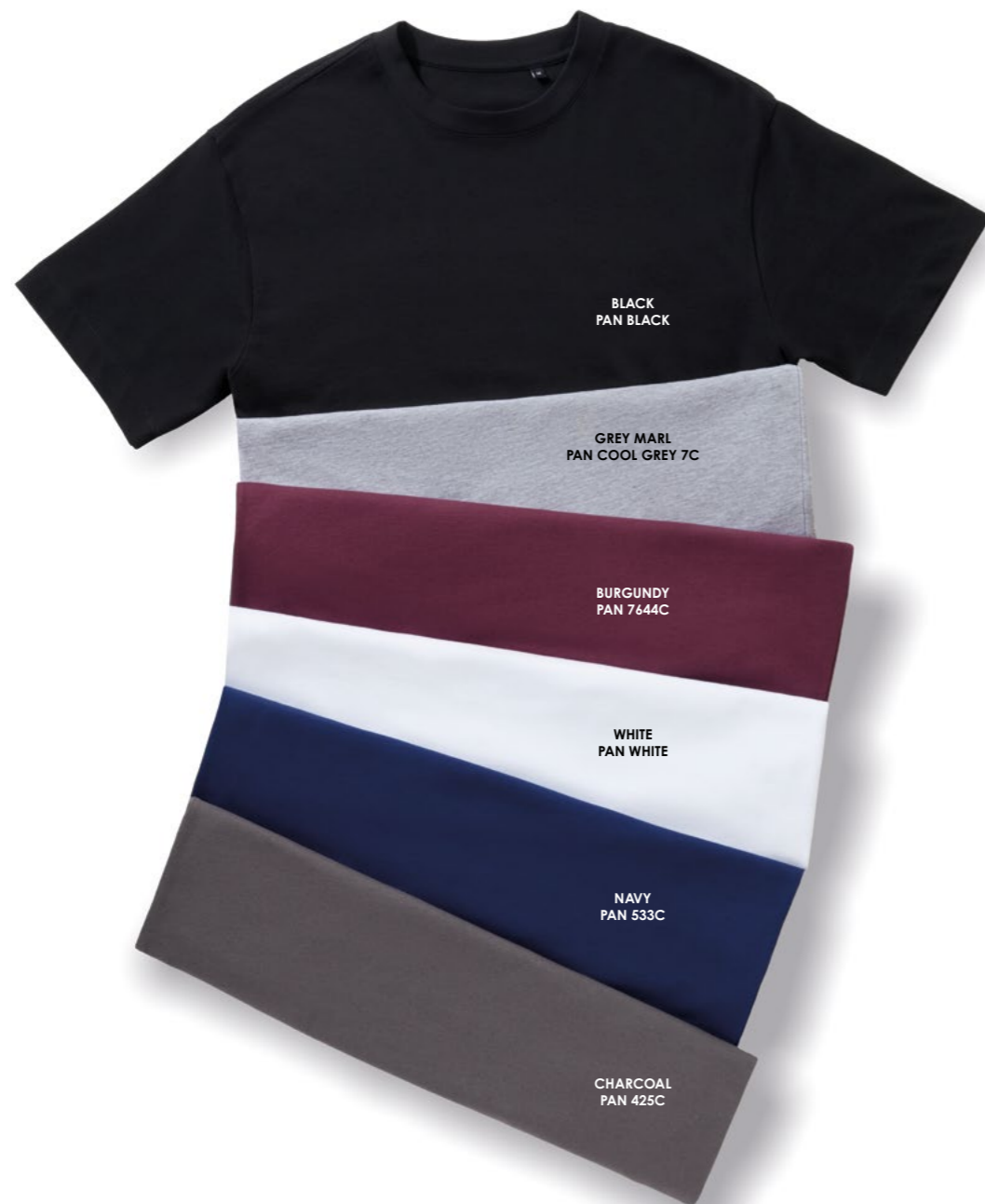
AM015 Anthem Heavyweight T-shirt

We've upped our game with this iconic heavyweight t-shirt. At 220gsm, it's a substantial weight with a retail-ready oversized cut. Available in our most popular colourways, it's designed with music and fashion lovers in mind.