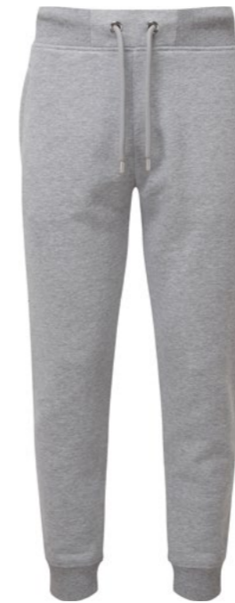
GREY MARL PAN COOL GREY 7C

Kick back and chill in these ultra-soft and fleecy joggers in a choice of classic colours. The ribbed waistband with jumbo, colour-matched draw cord offers a relaxed fit, while the brushed inner fleece makes them so cosy to wear.