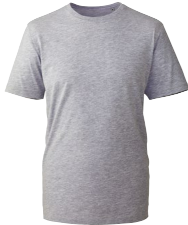
GREY MARL PAN COOL GREY 7C