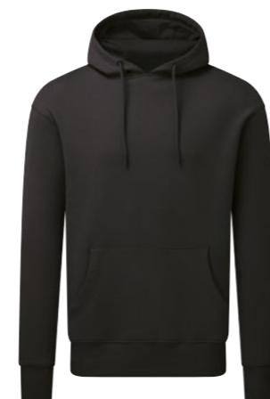
BLACK PAN BLACK