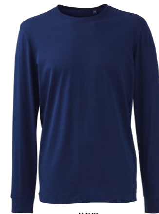
NAVY PAN 533C

A cool twist on our iconic t-shirt. Long cuffed sleeves counterbalance the ribbed crew neck with a retail fashion fit and soft-feel finish. Fashioned in solid shades of 100% organic cotton, or marls in 60% organic cotton with 40% recycled polyester. All longing to be adorned with your own decoration.