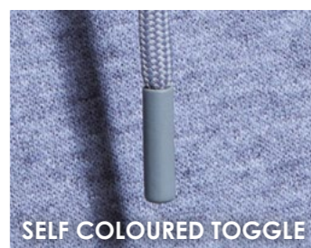
SELF COLOURED TOGGLE