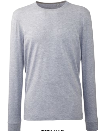
GREY MARL PAN COOL GREY 7C