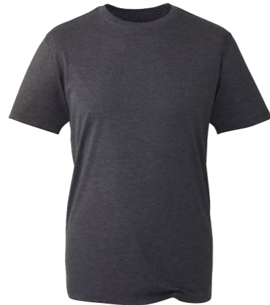
DARK GREY MARL PAN 425C