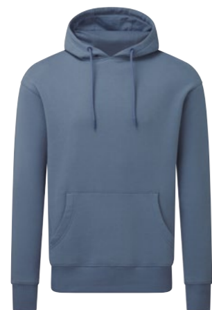
INDIGO BLUE PAN 2166C