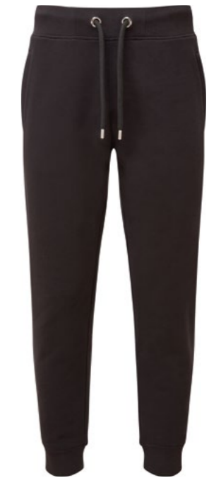
BLACK PAN BLACK